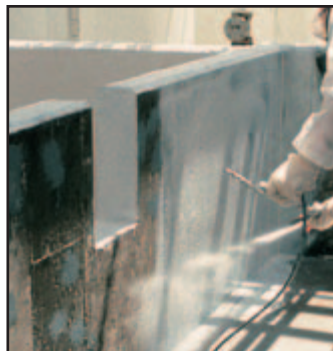
LOXON Conditioner's penetrating formula goes on quickly and easily.