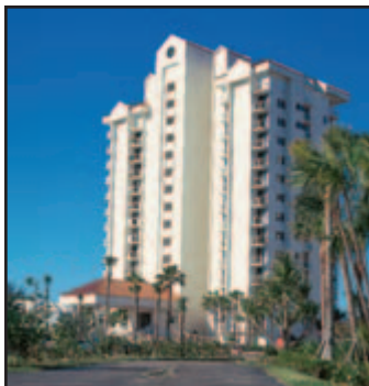
Apply on new construction after only a seven day cure.

Proven on concrete, brick and stucco nationwide